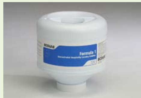
EcoLab - Formula 1 Single-Step Detergent

usage by up to 34%, energy usage to heat water by up to 45% and packaging waste by up to 80% compared to a typical 5-gallon detergent. EcoLab's EcoLogic Environmentally Responsible product line was developed with our Earth in mind. This offers you the opportunity to help your business while helping the environment.