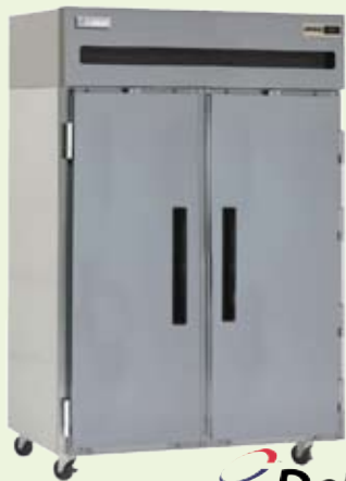
Delfield Double Door Reach-in Refrigerator/Freezer