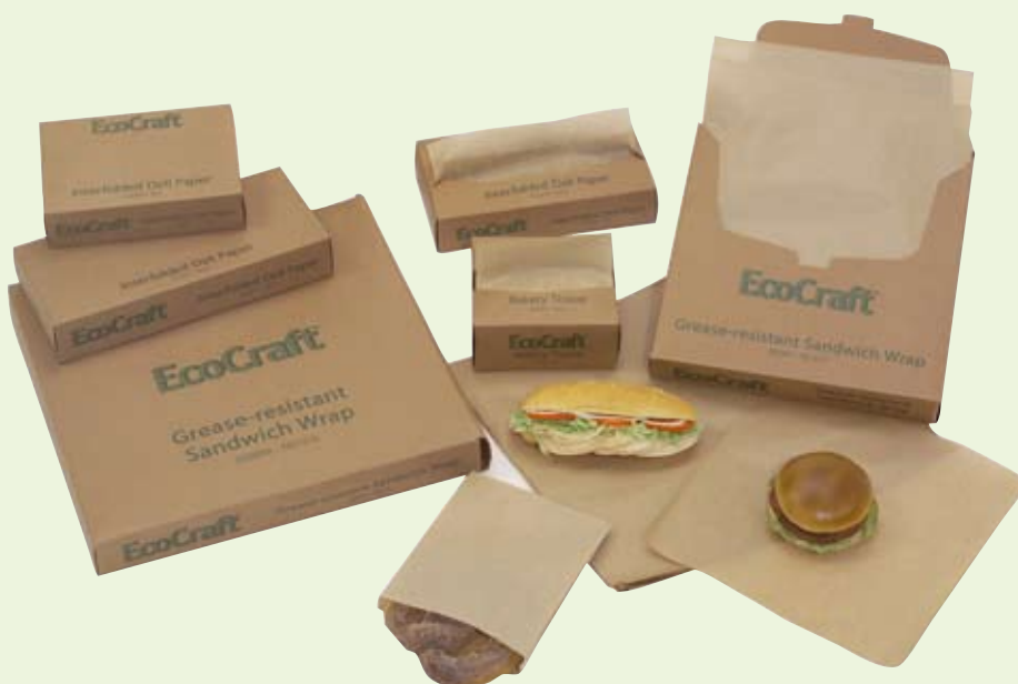
Bagcraft - EcoCraft

This environmentally responsible line from Bagcraft Papercon consists of sandwich wraps, bakery tissue, Deli paper, bake pan liner, stand up window bags, bread bags and freezer paper. Manufactured from Chlorine-free pulp and soy-blend eco-wax, these FDA Approved products are approved for standard waste disposal and are made with 100% recycled cartons printed with soy-based ink. You can keep them simple or get them printed with your design upon request. EcoCraft – The Natural Advantage.