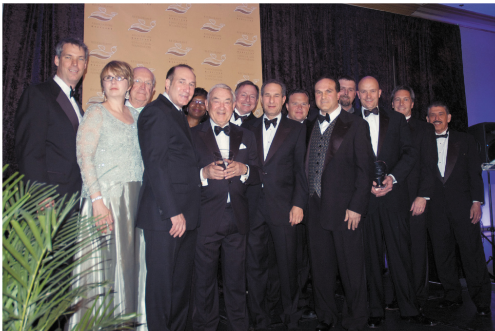
Members of Acme Paper's executive team lead the Hospitality Hall of Honor Class of 2010