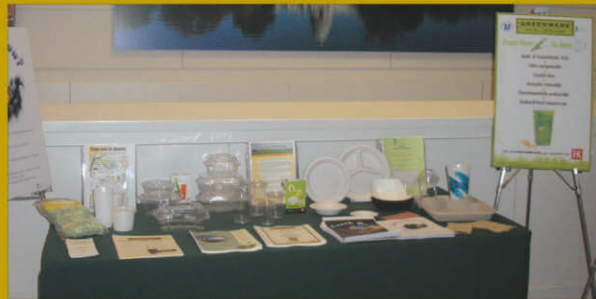
Acme Paper displays green options at GSI's annual Green Show

Not only does GSI get involved in the community and engage in recycling programs, but the company also "thinks green" when making purchases for its business operations. In using energy efficient food service equipment such as ice machines and refrigeration units and several of Acme's green chemicals and products, GSI is again