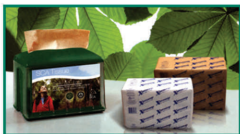
Communicate your environmental message with XpressNap's Ad-a-Glance feature!

Ask your Acme representative about the full line of environmentally preferred products from SCA.