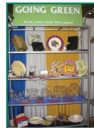
Acme Introduces "Going Green" at a local Restaurant Show

The going green movement stretches across many different types of businesses and Acme Paper has assisted in the implementation of "green" alternatives in various outdoor entertainment operations, sports complexes, school systems and hotels throughout the mid-Atlantic.