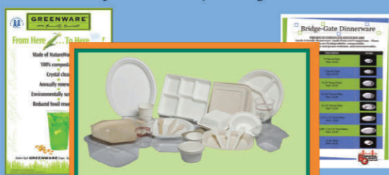
Assorted Green Packaging available through your Acme representative

Greenware from Fabrikal offers premium cold drink cups and lids derived from 100% natural corn materials and are fully compostable. These crystal clear cups with a smooth rolled rim can be custom-printed with your logo or environ-